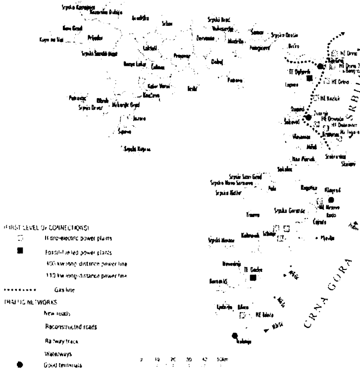
Map 1. - Planned connections between the Republic of Srpska and the Republic of Serbia and the Republic of Montenegro

On the end, it is necessary to underline that every higher level related to the examination of scope and category of solutions, more exactly of planned solutions of future mutual relations stated in the spatial plans of neighbour macro regional zones, contains elements and characteristics of lower levels of proposed future mutual relations for neighbour zones.