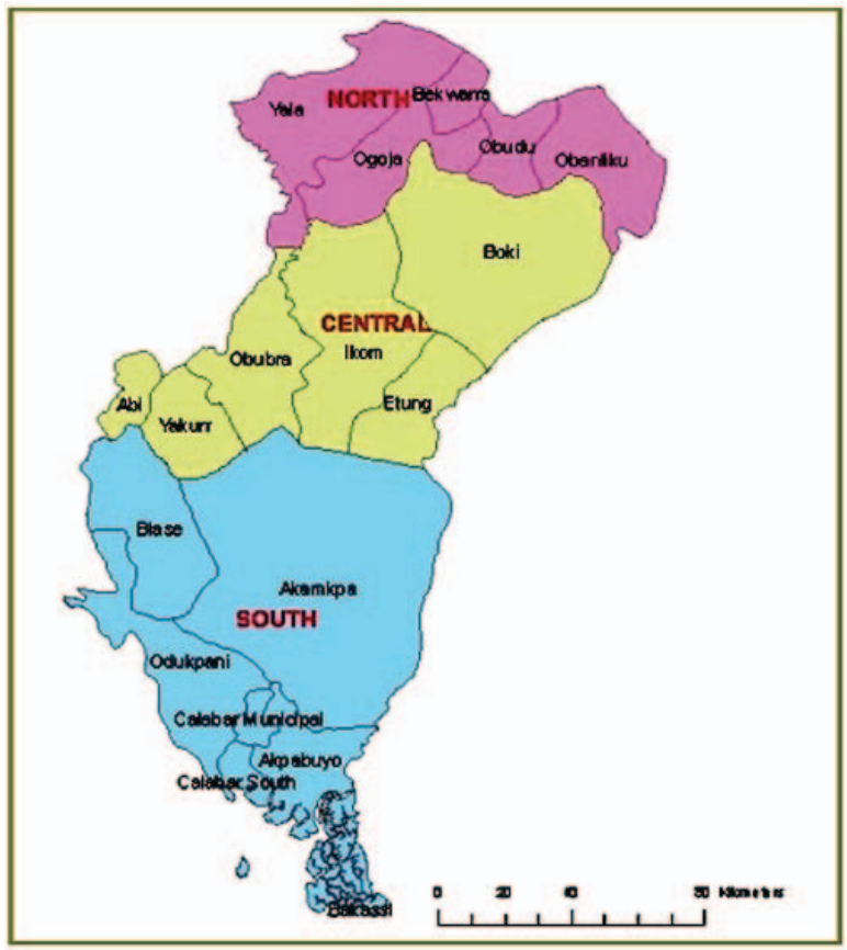
Figure 3: Cross River State showing Calabar FTZ in the Municipality near Calabar South LGAs at southern part.

Bakassi peninsula to the Republic of Cameroun, as the end of the socio-economic path to success. Previously, Calabar people had been viewed as those whose highest achievement ends with becoming bureaucrats in government because its territory was without industrial manufacturing establishments (Ingwe, 2013c). However, it deserves mention that increasing manufacturing will inevitably be accompanied by deletion of environmental resource serenity and deterioration. This provides scope for examining the extent to which economic planning is being accompanied by incorporation of ecological principles, methods and approaches.