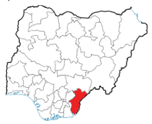
Figure 2: Nigeria showing study area: Cross River State –one of Nigeria's 36 states where the southern coastal Calabar city is capital, is shaded

The methods of description, case study and comparison were employed in this study. These methods were useful for clarifying various aspects of sub-national regional development scenarios in Calabar urban region, Cross River States and Nigeria as well as the embedded socio-economic and recent manufacturing investment development characteristics.