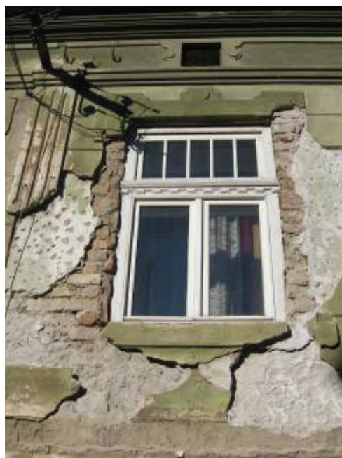
Figure 2. The poor condition of the facades in Podgradje.

the Lower Town has problems with moisture and water in basements. According to this analysis, it could be concluded with a substantial certainty that the facilities are in a poor condition and in need of reconstruction. Thus, it could be concluded that even the facades, as part of the public areas are exposed to moisture, and are also in very poor condition and require general reconstruction (Figure 2). The buildings are in a very poor condition, and that also relates to installations in them (Popović, 1996).